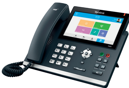
Yealink T48 phone