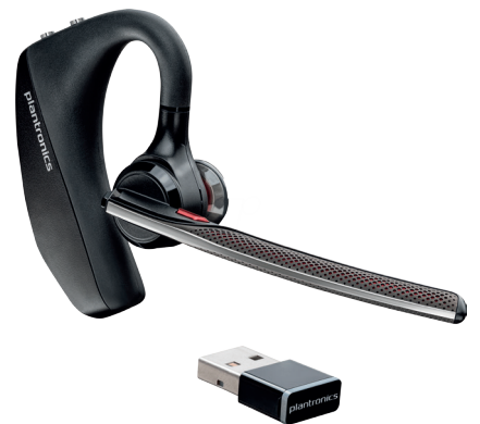
Plantronics 5200 UC headset