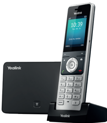
Yealink W56P handset and base station

Based on industry standard Asterisk technology that is used by millions of companies world-wide, with inbuilt firewall and secure encryption, Advitel is one of the most reliable and secure systems on the market.